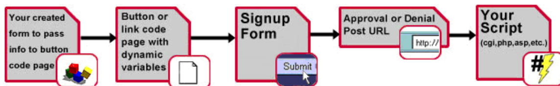
Figure 2 – Data Flow with Multi-Part Form and Dynamic Variables

The form you create will pass data entered by the consumer to the next form, which will then pass the variables to the CCBill signup form. Upon completion of the transaction, data will be sent to the Approval or Denial Post URL.